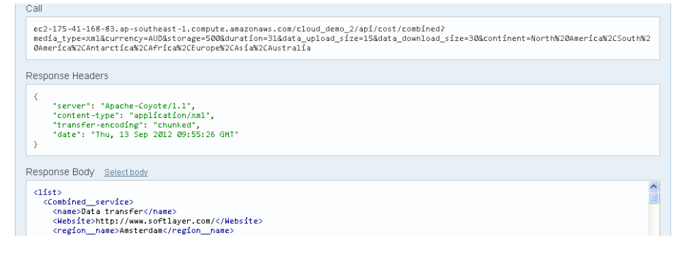
Figure 5. REST call via HTTP GET request